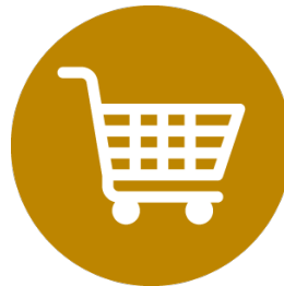
TROLLEYS & RACKS