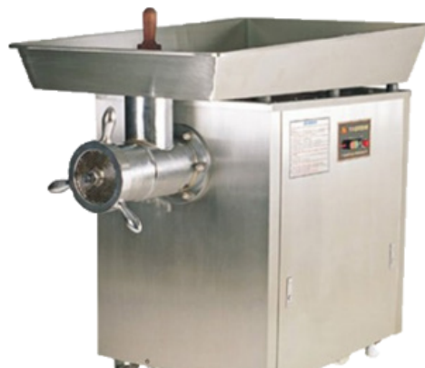
Food Preparation Equipment