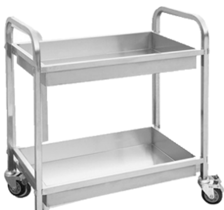
Tables & Trollys