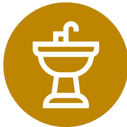
WORK TABLES & SINK