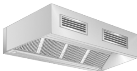
Exhaust Hood & Fresh Air System