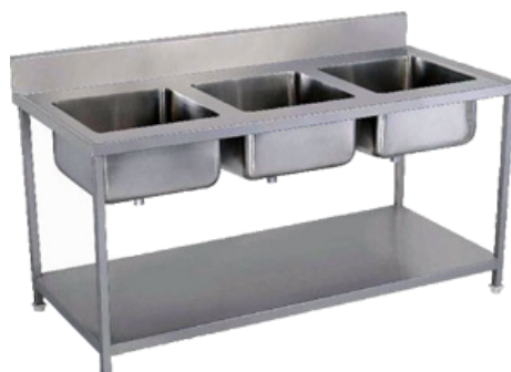
Wash Area Equipment